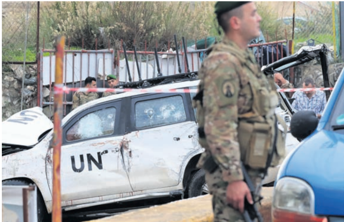
Lebanese soldiers stand next to a damaged UN peacekeeper vehicle at the scene where a UN peacekeeper convoy came under gunfire in the Al-Aqbiya village, south Lebanon, Thursday, Dec. 15, 2022.